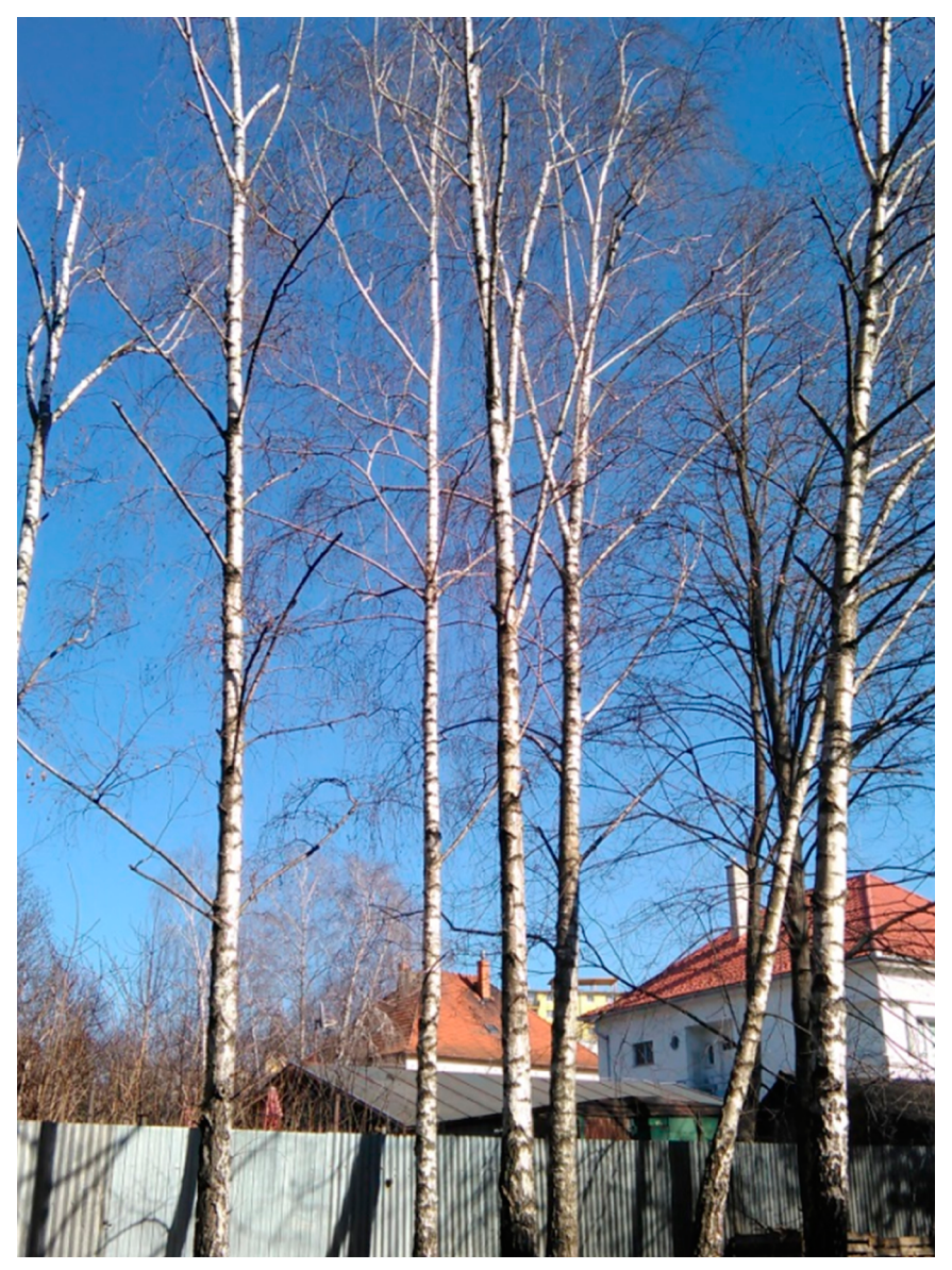
■ Figure 2: SEQ FIGURE \* ARABIC 2 The rejuvenation pruning was requested for these trees growing close to each other.