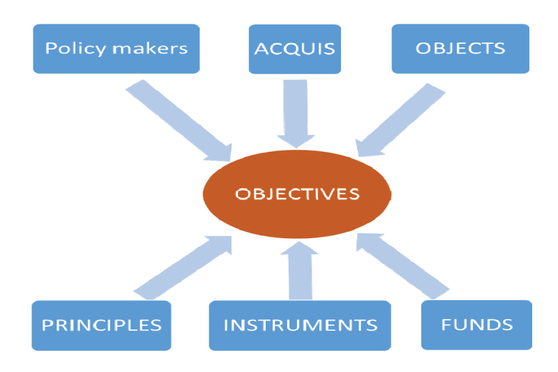
Figure No 1 – Acquis communautaire – legislative base the CAP.<sup>59</sup>

The Common Agricultural Policy is the oldest EU policy. Its historical development started in 1962 and is being continuously developed until the present time. The CAP is the comprehensive system consisting of particular components with interrelations presented in the following Figure No 1.